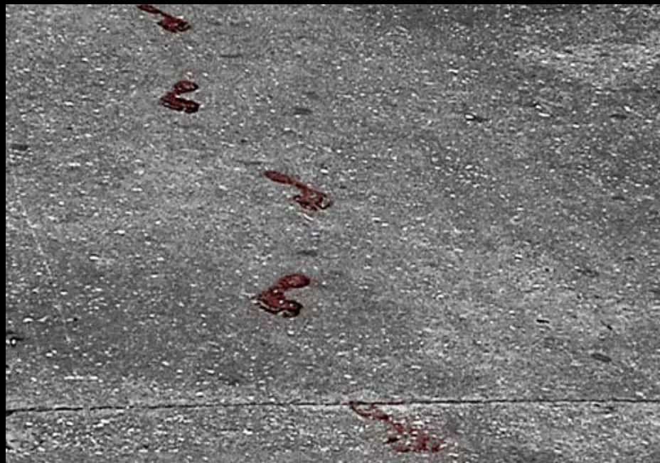
Regina José Galindo ¿Quién puede borrar las huellas? ( Who Can Erase the Tracks? ) 2003; colour photograph (Víctor Pérez) performance (detail), Guatemala City