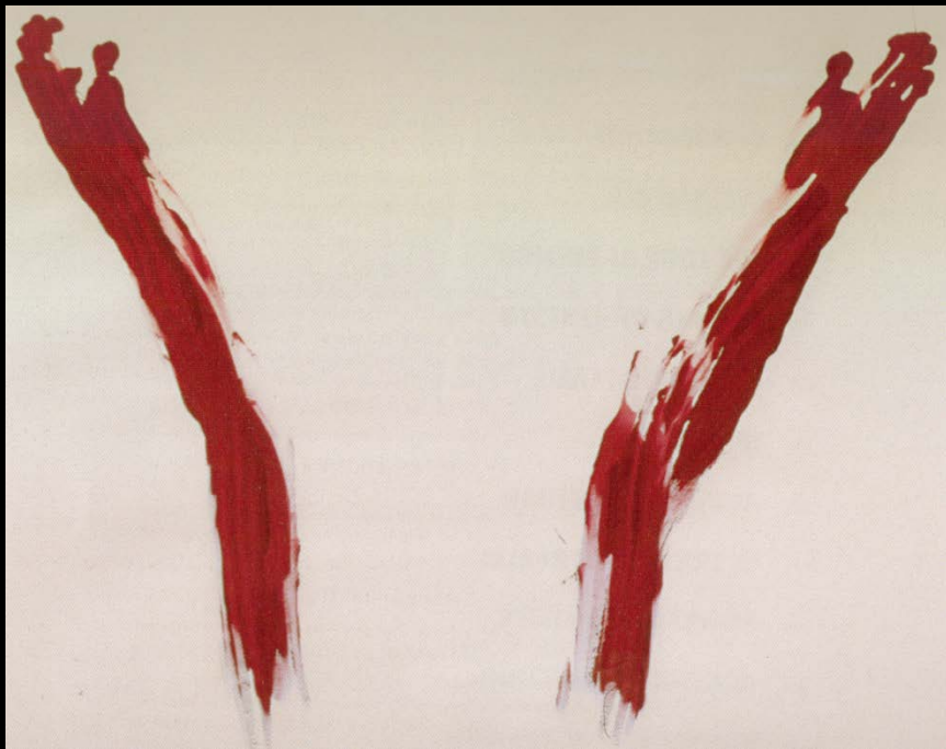
Ana Mendieta, Rastros Corporales (Body Tracks) 1982; blood and tempera paint on paper one of three works, each 96.5 x 127 cm Rose Art Museum, Brandeis University, Waltham, Massachusetts