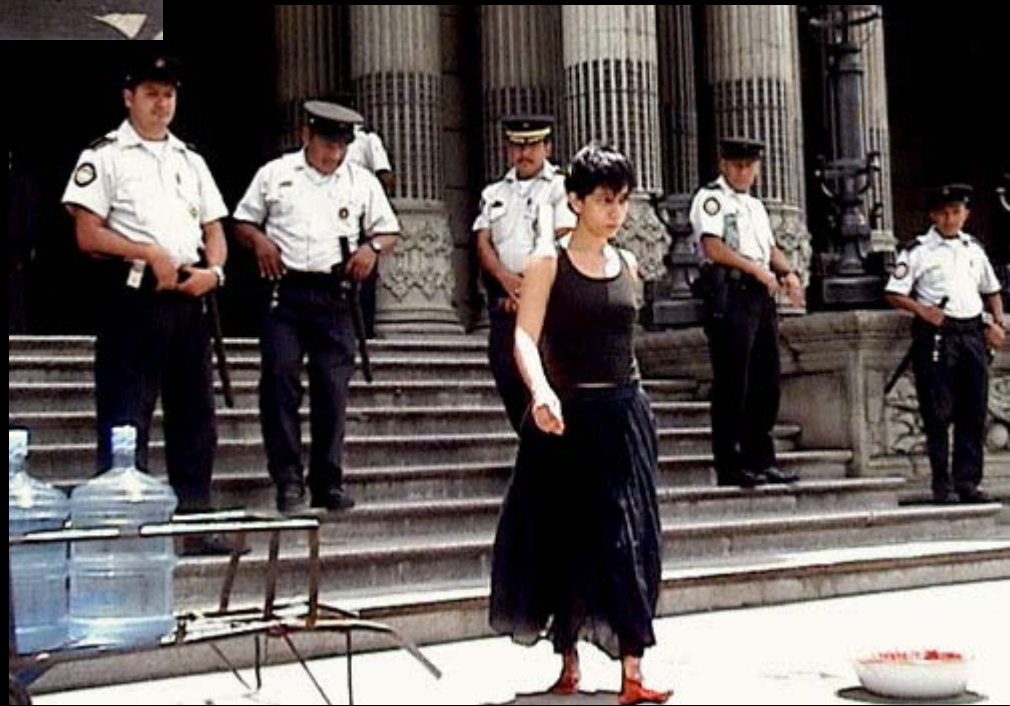
Regina José Galindo ¿Quién puede borrar las huellas? ( Who Can Erase the Traces? ) 2003; colour photographs performance, Guatemala City